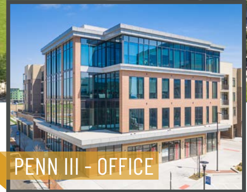
PENN III - OFFICE