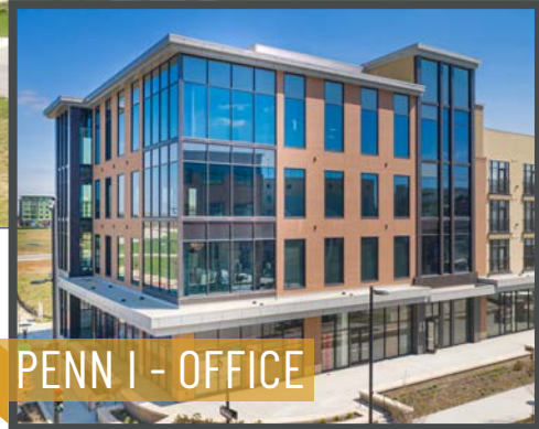
PENN I - OFFICE