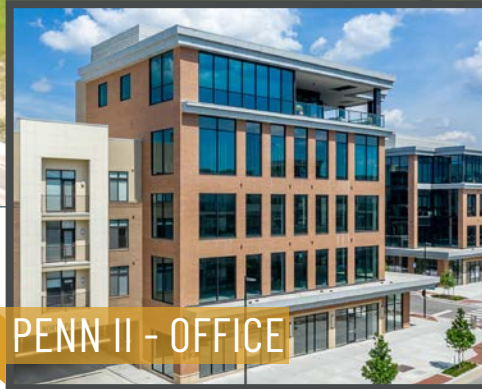
PENN II - OFFICE