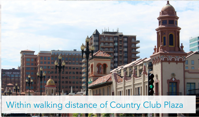
Within walking distance of Country Club Plaza