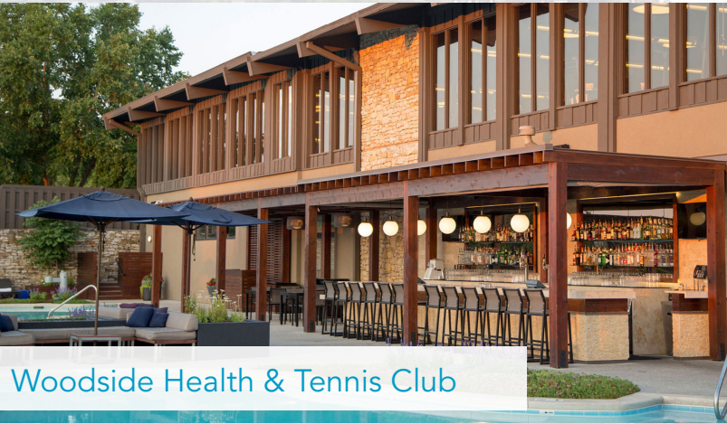
Woodside Health & Tennis Club