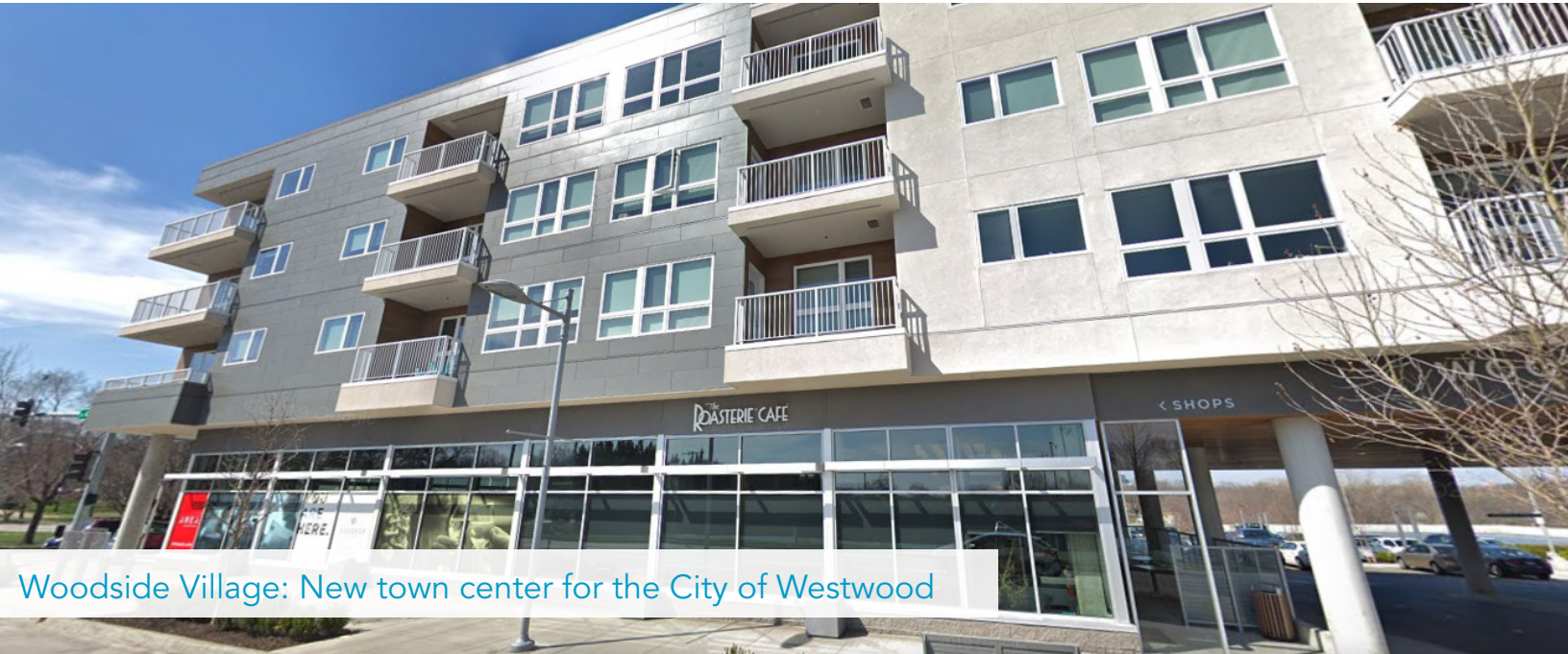
Woodside Village: New town center for the City of Westwood