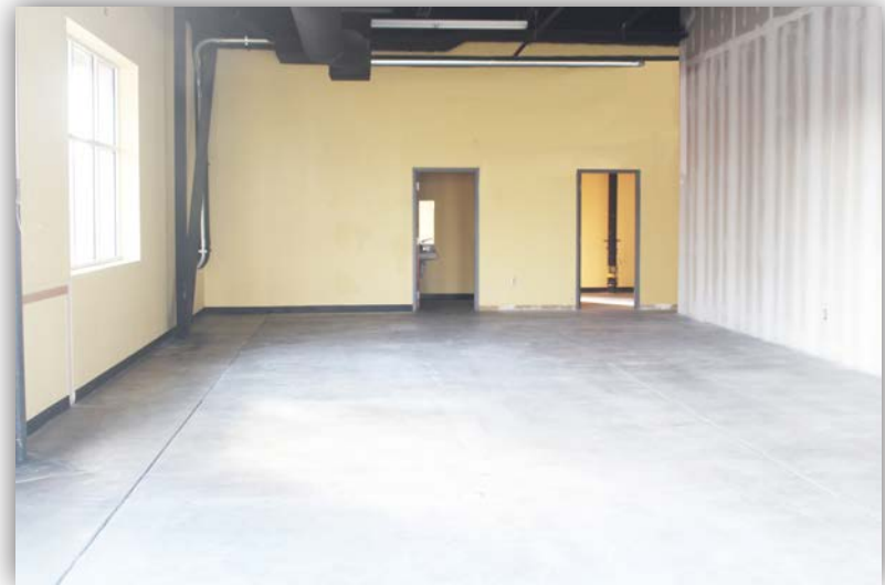
* Image may not reflect current state of vacant space