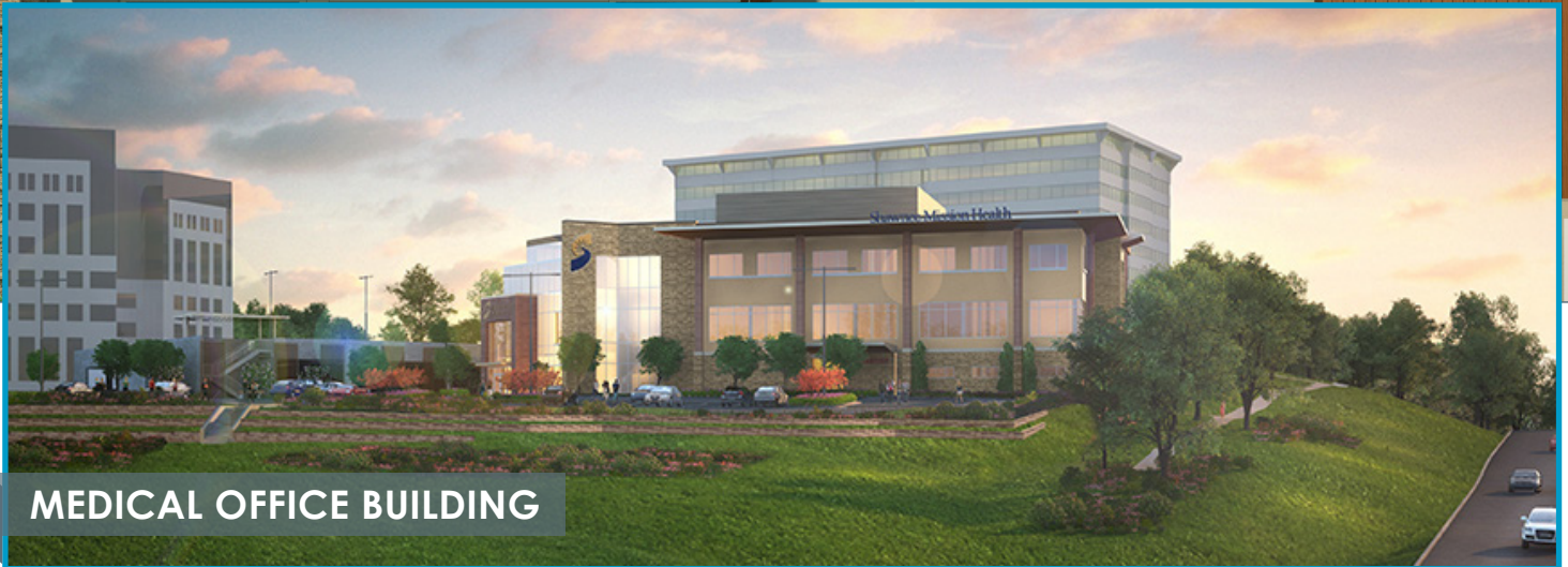
MEDICAL OFFICE BUILDING