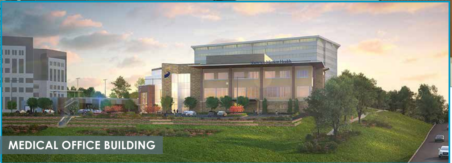
MEDICAL OFFICE BUILDING